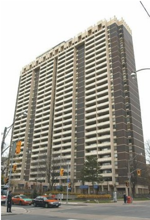
Greenwin Property Management Inc. 100 Wellesley St East