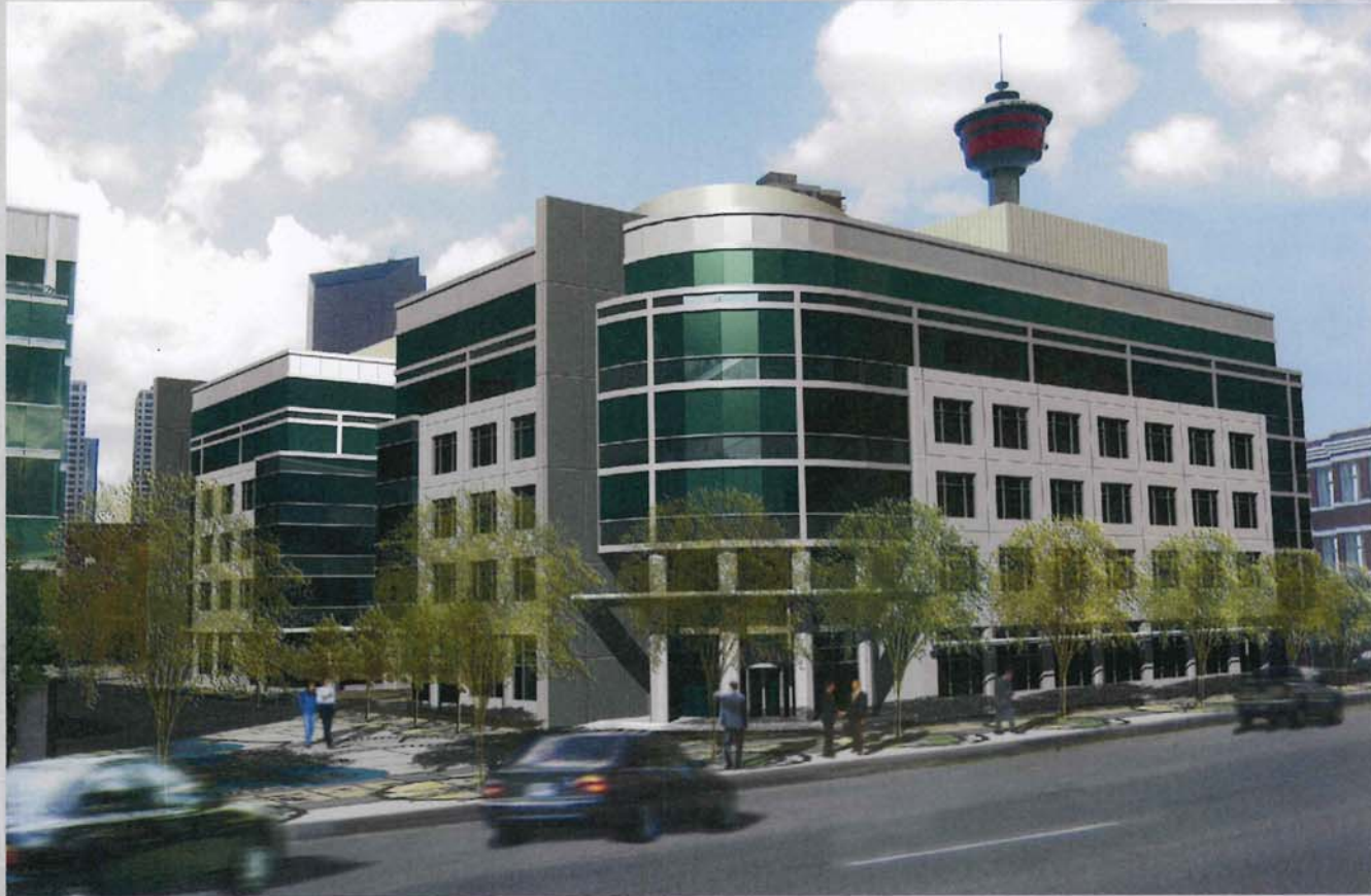
12 TH AVENUE - PERSPECTIVE VIEW FROM S.W.