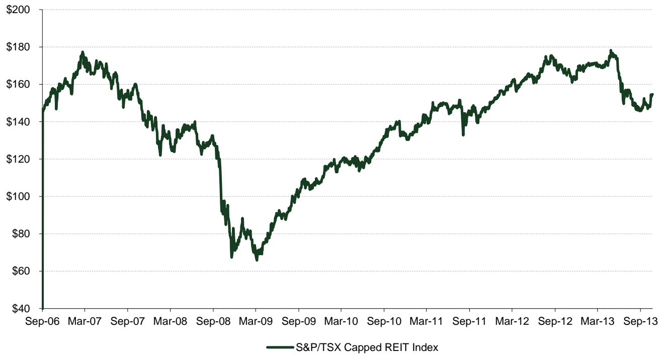
S&P/TSX Capped REITs Index Performance