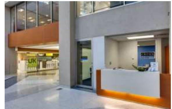
Management Office Front & Centre