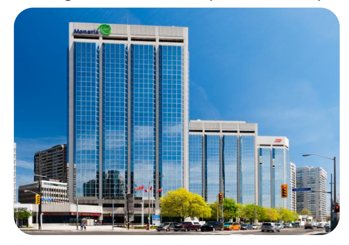
Starlight Commercial Asset (Toronto, Canada)

Many institutional investors are also attracted by the opportunity to invest alongside a small number of like minded investors who are also committing substantial amounts of capital. This is in contrast to being part of a fund with a large number of investors that they did not have input in selecting.