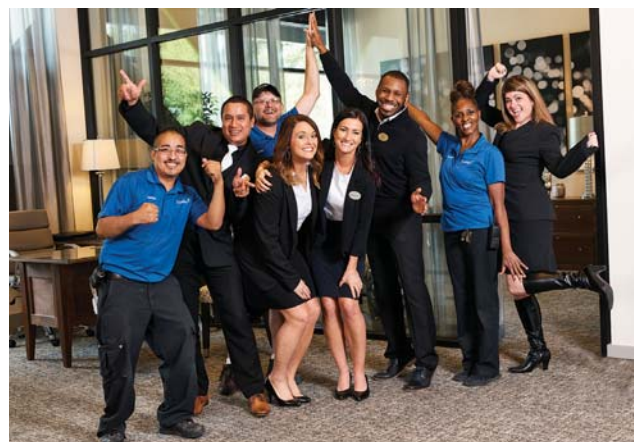
Camden's front line employees love taking care of their customers.

A few examples of how Camden has supported this philosophy is increasing diversity on its board of