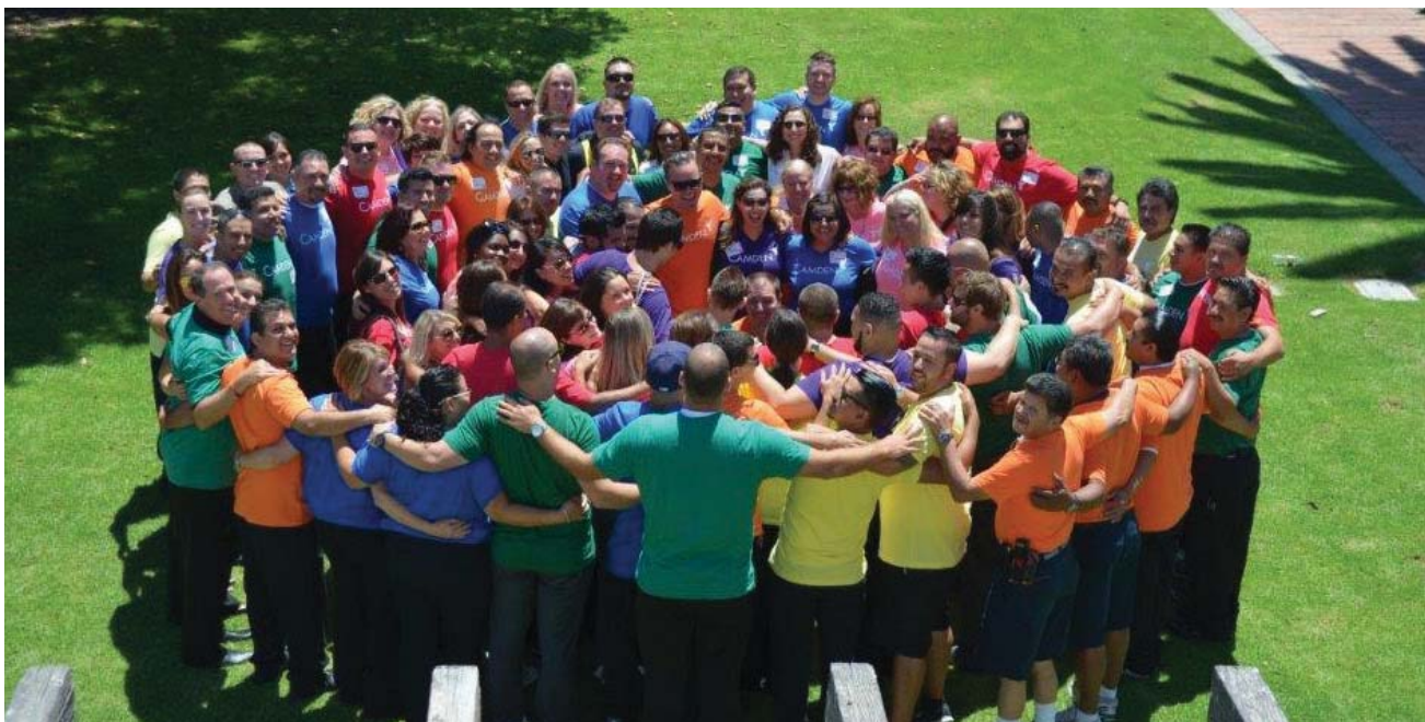
Camden's tight-knit culture