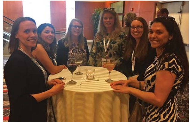
Female attendance hit nearly 40% at SVN's national training session for brokers in Chicago in 2017.