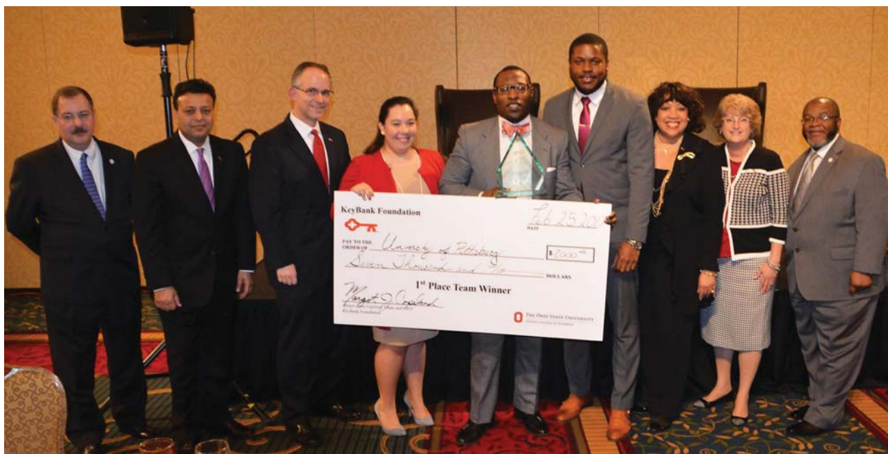
KeyBank Foundation and The Ohio State University partnered to host the 13th annual KeyBank and Fisher College of Business Minority MBA Case Competition in Cleveland, Ohio.