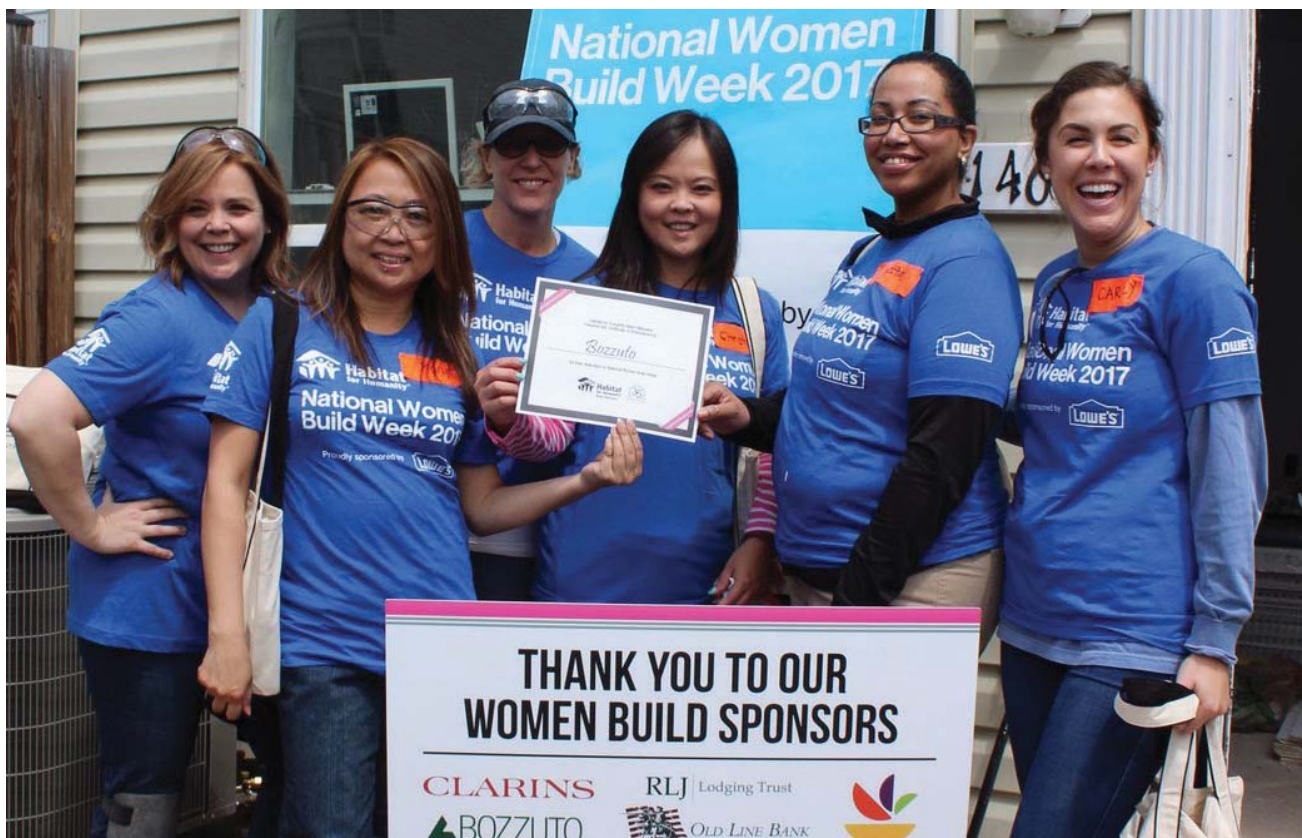
Women of Bozzuto Construction Company volunteer at National Women Build Week 2017