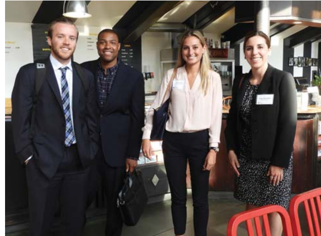
Attendees at the showing of the movie, Girl Rising, sponsored by the Miles & Stockbridge Women's Network and the firm's Social Impact Committee.

Law360, a legal news service, ranked Miles & Stockbridge second in the nation in 2016 on its list of "Best Law Firms for Black Attorneys." The American Lawyer , a monthly magazine for the legal profession, recognized Miles & Stockbridge as one of the firms on its 2017 Am Law 200 list with the highest percentage of African-American attorneys. In the spring of 2017, the firm was one of six finalists from around the country honored for diversity efforts by a large financial institution client. In