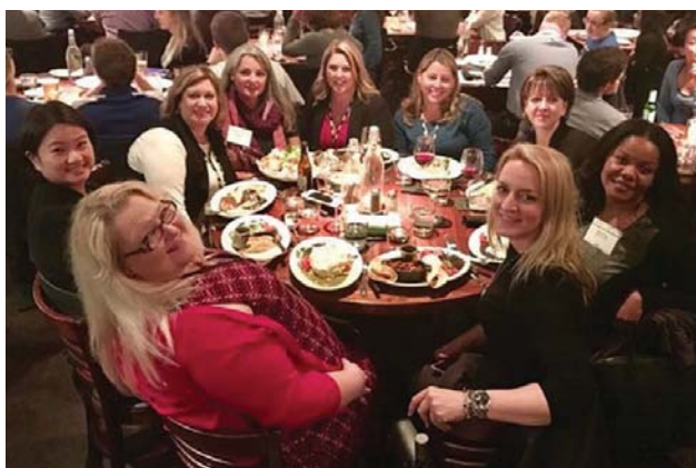
The Women’s Networking Forum provides an atmosphere where CBRE women can meet to share best practices, explore new ideas, and build their business skills.

Employee networking groups are one of CBRE’s key diversity initiatives, and the Women’s Network is only one of seven. Additional groups are: African-American Network Group, Asia Pacific Network, CBRE Military,