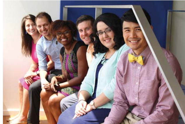
Camden's future leaders

Because Camden hires and promotes internally based on a team member's demonstrated abilities, the firm appeals to female candidates. They can be confident in the knowledge that their career progression will be