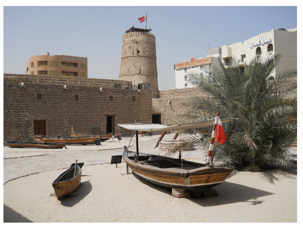
Museum Dubai UAE Arabic Ancient Historic by TadM, 2011, used under Pixabay license.