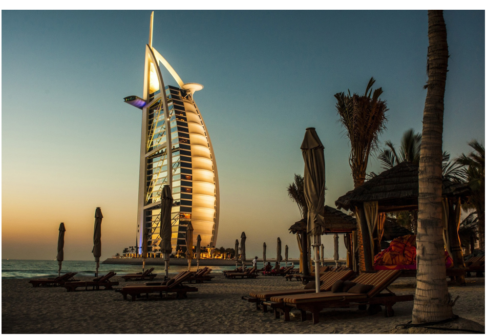
Burj Al Arab Dubai Hotel

The need for regulatory clarity and support. Policymakers can capture full benefits from blockchain in smart city development by providing an enabling regulatory environment. Officials designed the existing regulatory framework for a centralized utilities market. For example, energy market regulations define how a networked tariff is created, how transactions should happen, how retailers charge consumers and how consumers pay for energy. Government should create sandboxes in which innovators can demonstrate how blockchain and other digital technologies function and which benefits are possible in enabling smart cities. A sandbox should be an environment in which startups, technology firms, regulators, and other stakeholders can undertake open, risk-free exploration of blockchain and other digital technologies. The outcomes of a sandbox should then inform the necessary regulatory reform that redefines the trading model of the entire economy, including mechanisms to ensure the cybersecurity of data exchange.