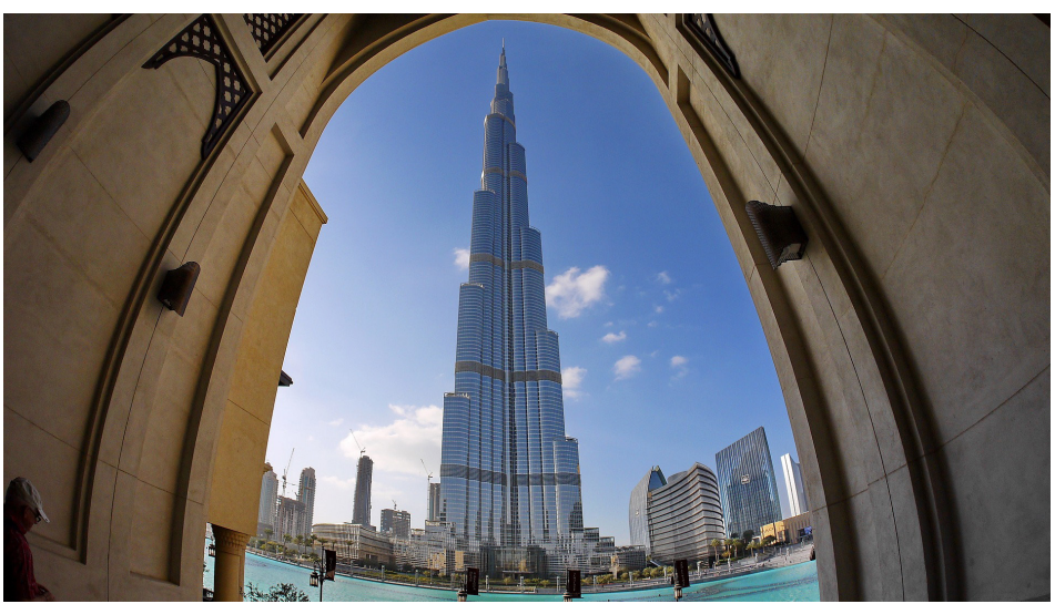
Dubai Desert, Burj Kalifa by Hans-Jürgen Schmidt (BS1920), 2012, used under Pixabay license.

Smart projects are underway in lots of cities, ranging from streetlights capable of assessing traffic flows to smart energy grids reacting instinctively to fluctuating demand. Yet, only a few cities can claim to be truly smart. We have the digital technologies to automate a myriad of infrastructural processes that support a city, but the key