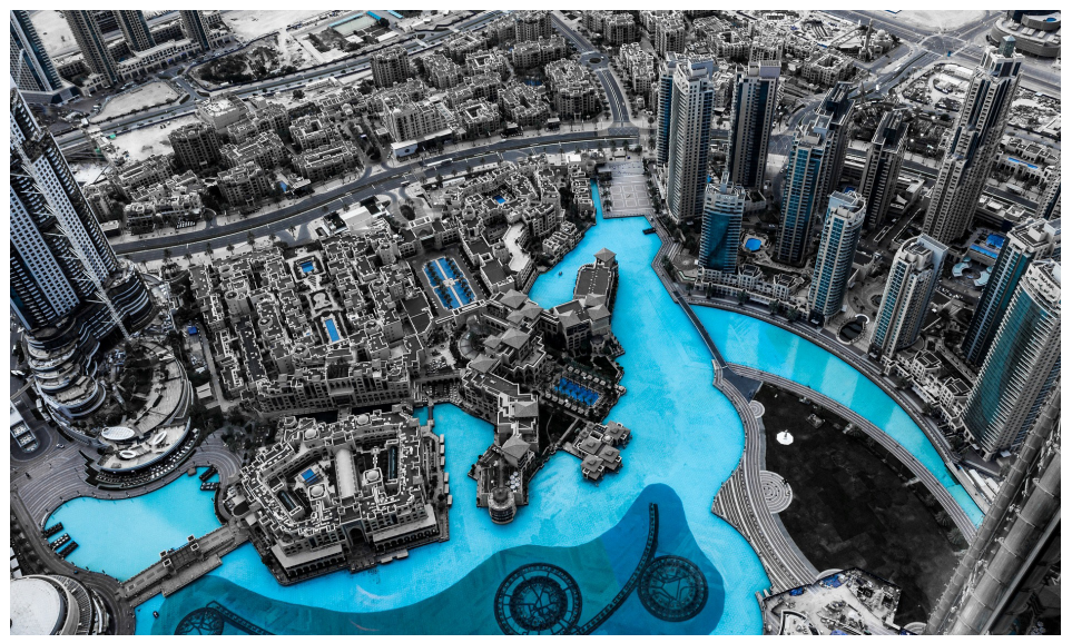
Dubai Skyline City Architecture Skyscrapers by Martinschuschi, 2017, used under Pixabay license.