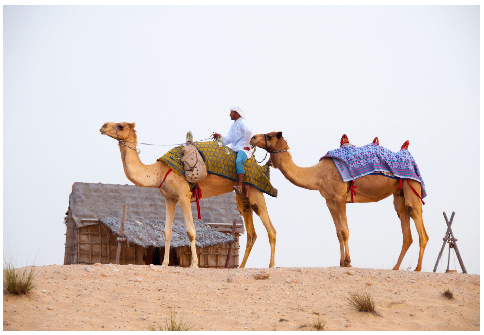
Desert Camels Dubai by Jacqueline Schmid (Schmid-Reportagen), 2014, used under Pixabay license.

Regarding the environmental dimension, Smart Dubai Office advocates citywide installation and integration of smart grids, smart meter water irrigation, smart sewage water treatment, smart storm water management, and smart waste management.